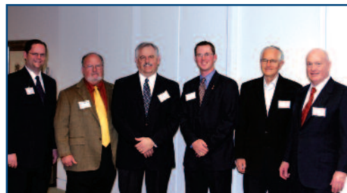
KA Order alumni

For those who live in the Dallas area, plans are already underway for the 2010 PAC event.