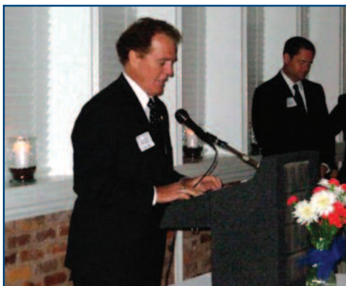
Congressman Phil Gingrey (R-GA/ΣΝ) addressed the attendees at the Atlanta PAC event.

Congressman Phil Gingrey (R-GA/ΣΝ) spoke and thanked the PAC for the support given to him and to many members of Congress. Congressman Gingrey also focused his remarks on the importance of getting the Collegiate Housing and Infrastructure Act attached to a bill and passed through Congress. He reaffirmed his commitment to CHIA and to doing what he could do for its passage.