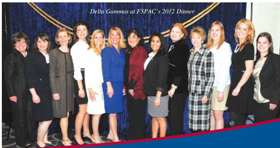
Delta Gammas at FSPAC's 2012 Dinner

The Fraternity & Sorority Political Action Committee is a bipartisan organization that supports the election of federal candidates interested in preserving the fraternity and sorority experience for future generations of student leaders. It advocates for public policy objectives that will allow students and alumni/alumnae to benefit from the academic, community and leadership development opportunities made available through the fraternity and sorority community.